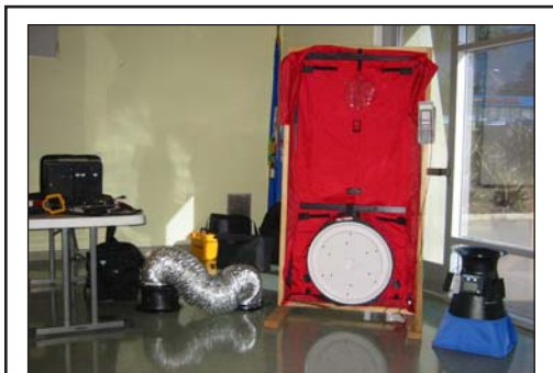
Some of the equipment used in home performance audits include blower doors to determine air leakage and infrared cameras to show areas of heat and air infiltration.